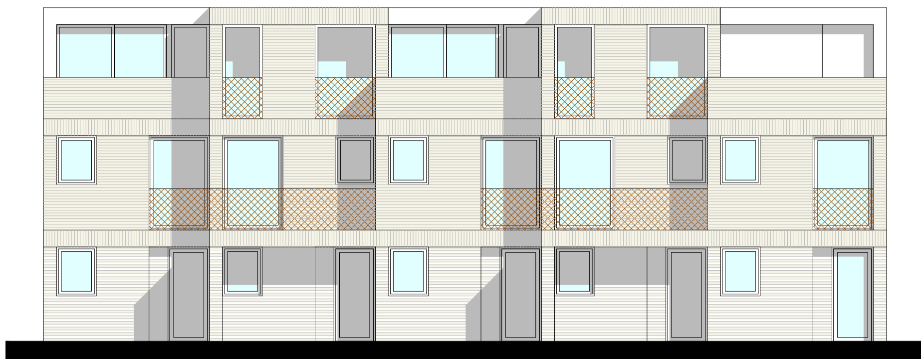
Proposed North Elevation - 1:100