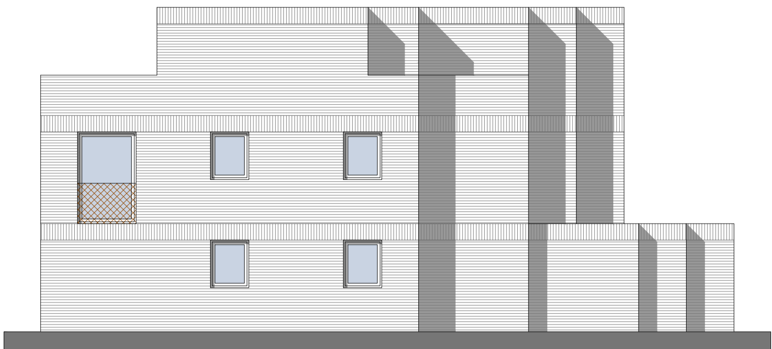
Proposed West Elevation - 1:100