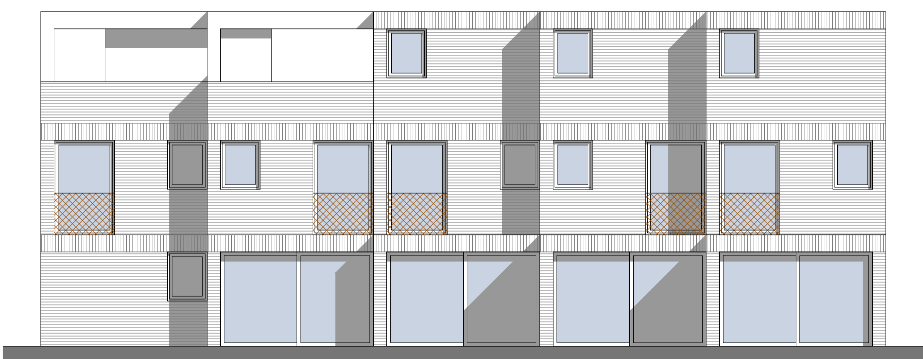
Proposed South Elevation - 1:100